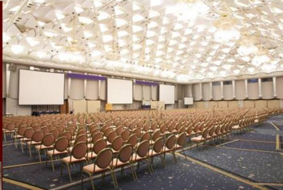
The International Convention Center Pamir at the Grand Prince Hotel New Takanawa

Grand Ballroom "Hokushin" (1,837 sq. meters)