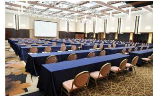
Grand Prince Hotel Takanawa "Prince Room" (768 sq. meters)

■ Meeting, corporate training, company briefing, seminar, etc.