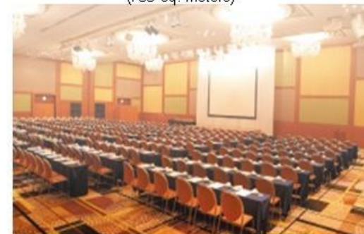
Shinagawa Prince Hotel "Prince Hall" (2,046 sq. meters)

There is a wide variety of banquet halls with distinct characteristics at Prince Hotels in the Takanawa/Shinagawa area--from small banquet rooms to large halls such as "Konron" (2,397 sq. meters/max. capacity of 1,512 guests, classroom format), "Prince Hall" (2,046 sq. meters/max. capacity of 1,600 guests, classroom format) "Prince Room" (768 sq. meters/max. capacity of 420 guests, classroom format).